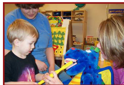
An I-Smile Coordinator providing oral health education

Coordinators strengthen and develop partnerships within early childhood and community organizations, establish referral networks, provide education and training for non-dental health care professionals, ensure care coordination for families, and see that children receive preventive care.