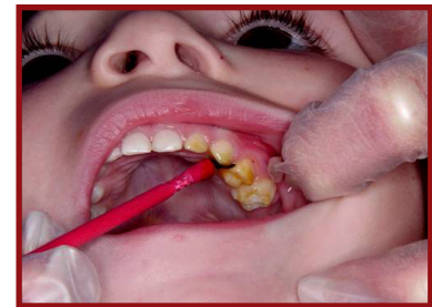
Application of fluoride varnish

Severe decay for a very young child often results in treatment in an operating room and can cost more than $10,000. The cost for three fluoride varnish applications in a year - highly effective in preventing cavities - is just $43.