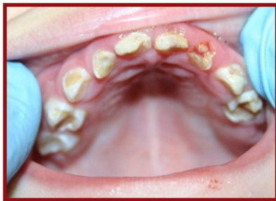
A 2-year old boy in NW Iowa with severe decay