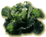
Green Leaf Lettuce